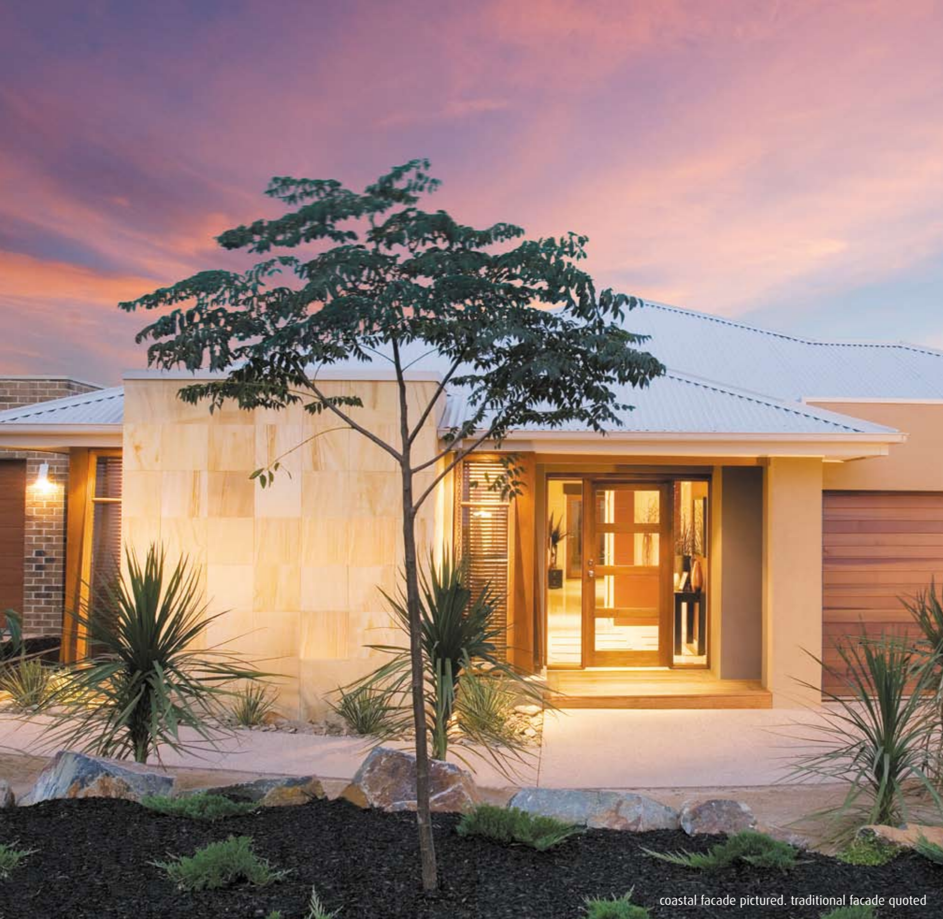
coastal facade pictured. traditional facade quoted